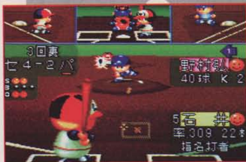
Getting into the game, Konami's Powerful Pro Baseball '94 will join the lineup.