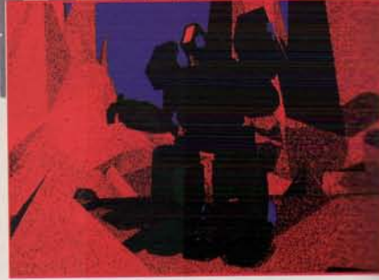
The 3-D shooter/action title Metal Jacket will be released from Pony Canyon.