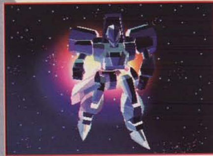
Red Plasm is another title from Sony for the 32-Bit system.

were treated to their first look at the mock-up of the hyper game system. Our sources describe it as a basic rectangle approximately the size of a notebook computer with the screen down.