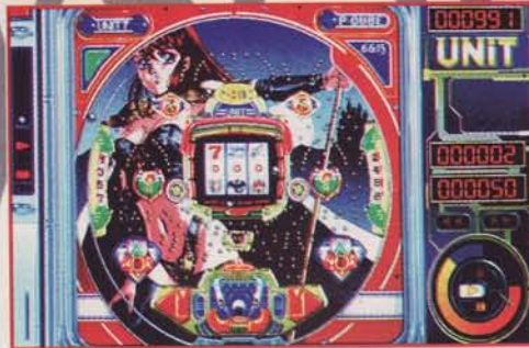
Sony Computer Entertainment will release V-Zone, a video pachinko game.