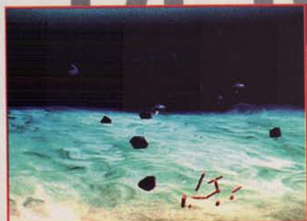
Art Dink will have a simulator for the system that is untitled as of yet.