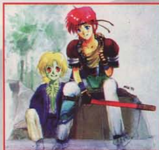
Right Stuff will have the RPG Blue Forest Story.

Although Sony did not show the system in operation, they did construct a dazzling demonstration using the Target Box development system. The first demo was an awesome T-Rex that was fully rendered using texture-mapped polygons. The beast was made to smoothly chomp away and run while being rotated