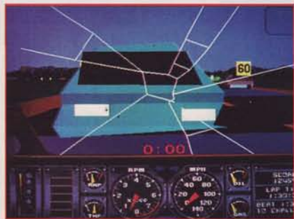
Another licensee, Tengen will offer the intense driver, Race Drivin'.