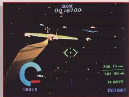
Another Namco offering, Star Blade , is a shooter with intense game play.

Although Sony did not show the system in operation, they did construct a dazzling demonstration using the Target Box development system. The first demo was an awesome T-Rex that was fully rendered using texture-mapped polygons. The beast was made to smoothly chomp away and run while being rotated